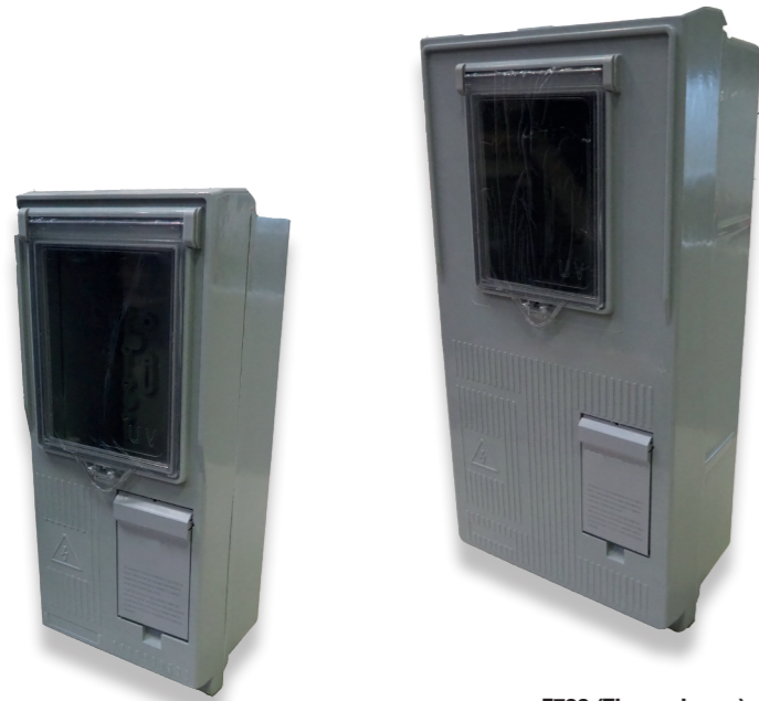
F732 (Single phase)